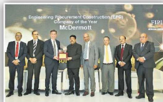
Engineering Procurement Construction (EPC) Company of the Year Awarded to McDermott