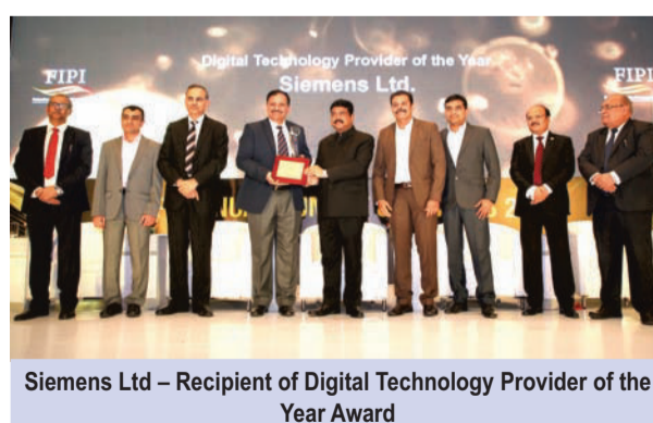
Siemens Ltd - Recipient of Digital Technology Provider of the Year Award