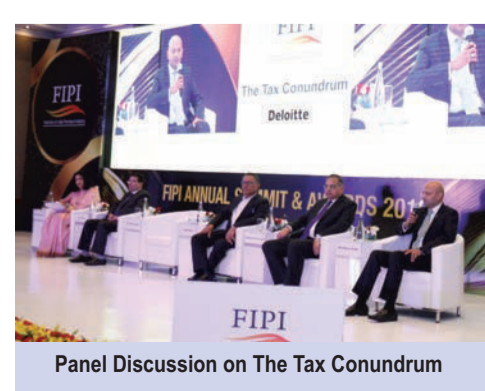
Panel Discussion on The Tax Conundrum