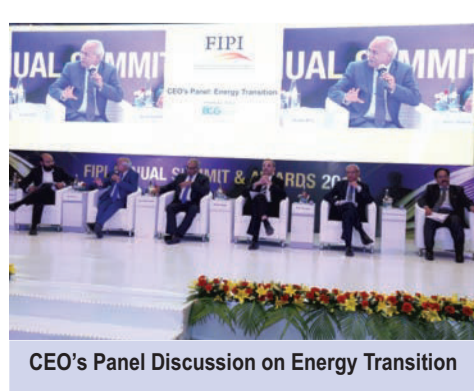
CEO's Panel Discussion on Energy Transition