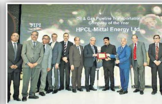
Recipient of Oil & Gas Pipeline Transportation Company of the Year Award - HPCL-Mittal Energy Ltd.