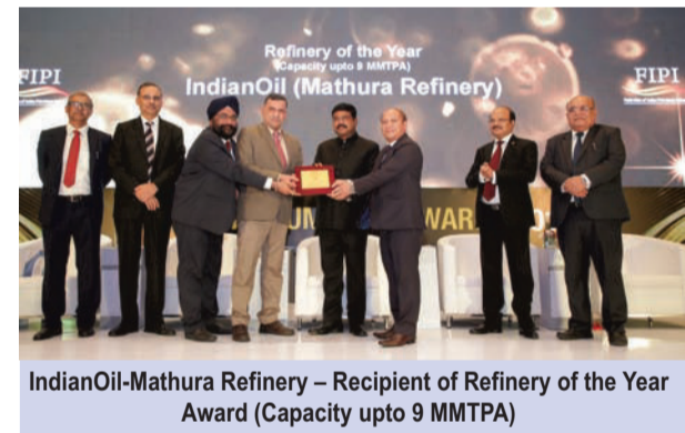
IndianOil-Mathura Refinery - Recipient of Refinery of the Year Award (Capacity upto 9 MMTPA)