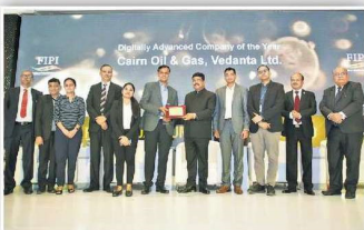
Recipient of Digitally Advanced Company of the Year Award - Cairn Oil & Gas, Vedanta Ltd.