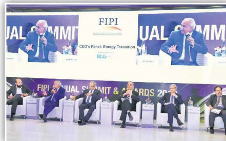
CEO's Panel Discussion on Energy Transition