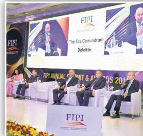
Panel Discussion on The Tax Conundrum