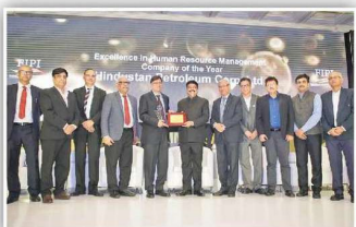
Recipient of Excellence in Human Resource Management Company of the Year Award - HPCL