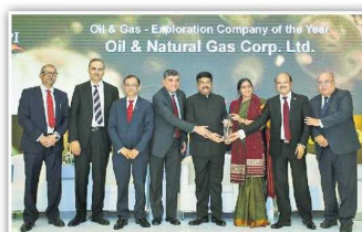
Oil and Natural Gas Corporation Ltd - Recipient of Oil & Gas Exploration Company of the Year Award