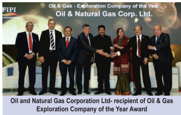
Oil and Natural Gas Corporation Ltd- recipient of Oil & Gas Exploration Company of the Year Award