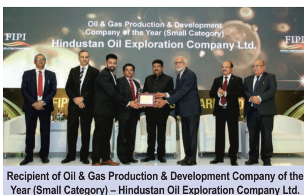
Recipient of Oil & Gas Production & Development Company of the Year (Small Category) - Hindustan Oil Exploration Company Ltd.