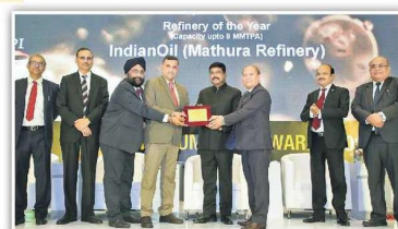
IndianOil-Mathura Refinery - Recipient of Refinery of the Year Award (Capacity upto 9 MMTPA)