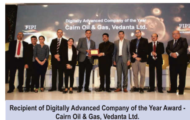
Recipient of Digitally Advanced Company of the Year Award - Cairn Oil & Gas, Vedanta Ltd.