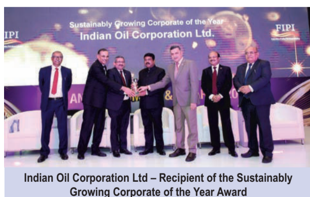
Indian Oil Corporation Ltd - Recipient of the Sustainably Growing Corporate of the Year Award