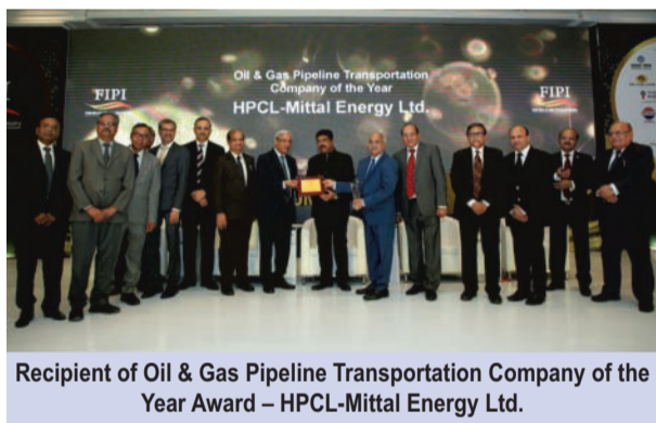
Recipient of Oil & Gas Pipeline Transportation Company of the Year Award - HPCL-Mittal Energy Ltd.