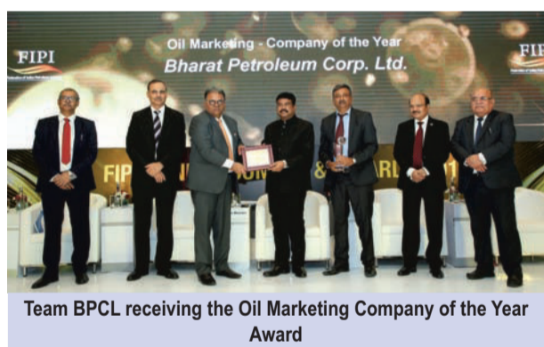
Team BPCL receiving the Oil Marketing Company of the Year Award