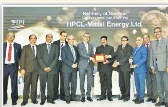
Recipient of the Refinery of the Year (Capacity - Higher than 9 MMTPA) - HPCL-Mittal Energy Ltd