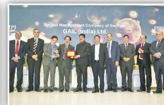
GAIL (India) Ltd - Recipient of the Project Management Company of the Year Award