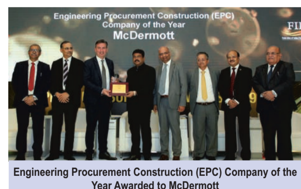
Engineering Procurement Construction (EPC) Company of the Year Awarded to McDermott