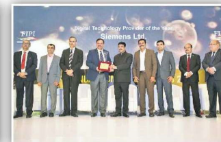
Siemens Ltd - Recipient of Digital Technology Provider of the Year Award