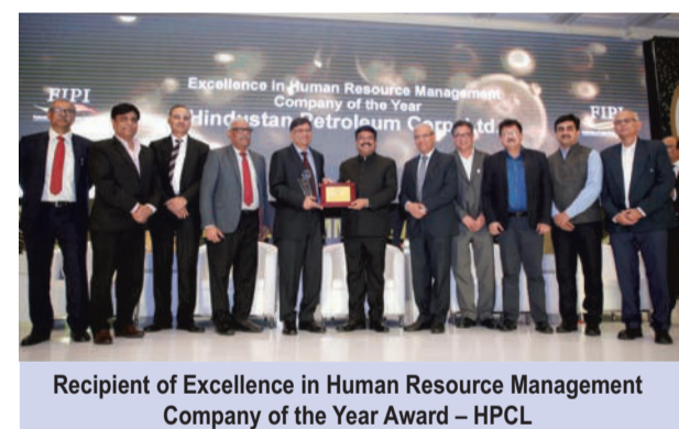
Recipient of Excellence in Human Resource Management Company of the Year Award - HPCL