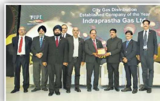
Indraprastha Gas Ltd - Recipient of the City Gas Distribution Established Company of the Year Award