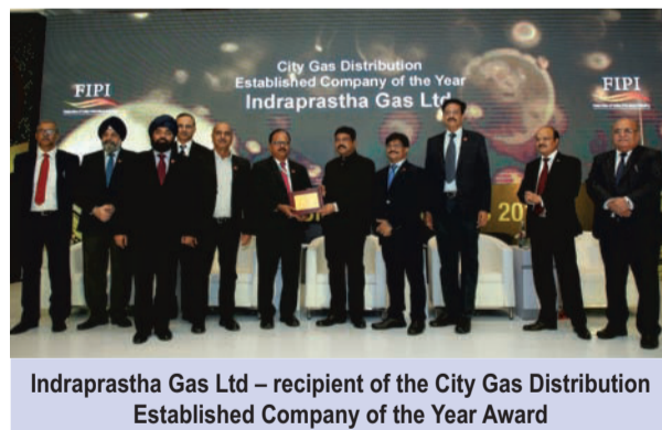
Indraprastha Gas Ltd - recipient of the City Gas Distribution Established Company of the Year Award