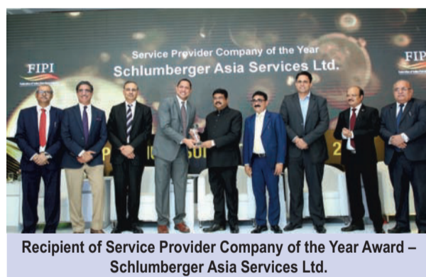
Recipient of Service Provider Company of the Year Award - Schlumberger Asia Services Ltd.