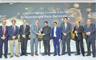
Recipient of Service Provider Company of the Year Award - Schlumberger Asia Services Ltd.