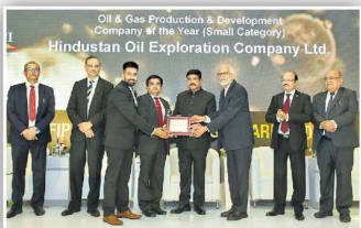
Recipient of Oil & Gas Production & Development Company of the Year (Small Category) - Hindustan Oil Exploration Company Ltd.