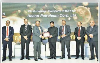
Team BPCL receiving the Oil Marketing Company of the Year Award