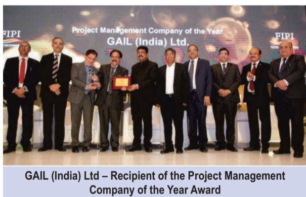
GAIL (India) Ltd - Recipient of the Project Management Company of the Year Award