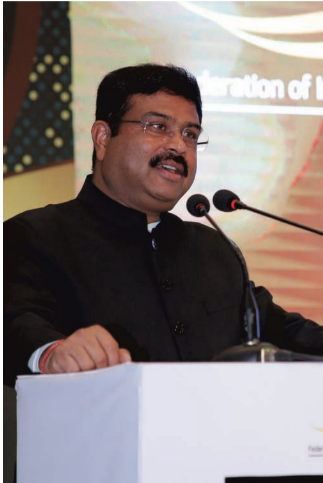
Union Minister of Petroleum and Natural Gas and Steel Shri Dharmendra Pradhan addressing the gathering of FIPI's Awards Ceremony

In the recent past, Government of India has taken numerous measures to create supportive policy ecosystem for the overall