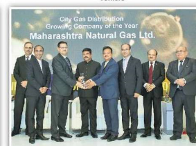
Maharashtra Natural Gas Ltd - Recipient of the City Gas Distribution Growing Company of the Year Award