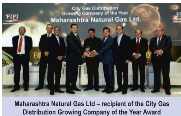
Maharashtra Natural Gas Ltd - recipient of the City Gas Distribution Growing Company of the Year Award