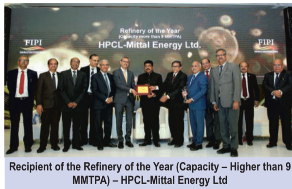
Recipient of the Refinery of the Year (Capacity - Higher than 9 MMTPA) - HPCL-Mittal Energy Ltd