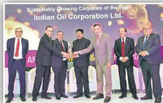
Indian Oil Corporation Ltd - Recipient of the Sustainably Growing Corporate of the Year Award